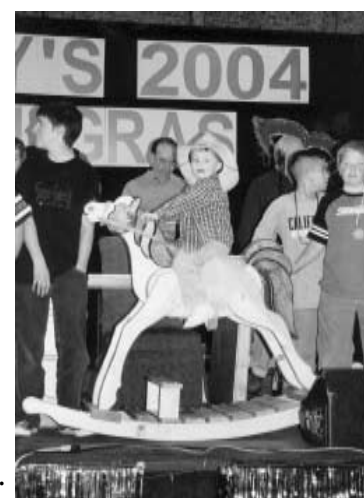
Auction item test drive.