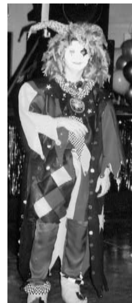
Flamboyant jester wins costume contest.