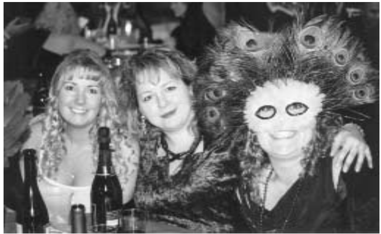
Revelers enjoying a break in the dancing.