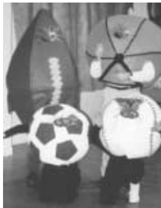
The Masquerade Balls - the punny, perennial Bogner & Frassinello show.