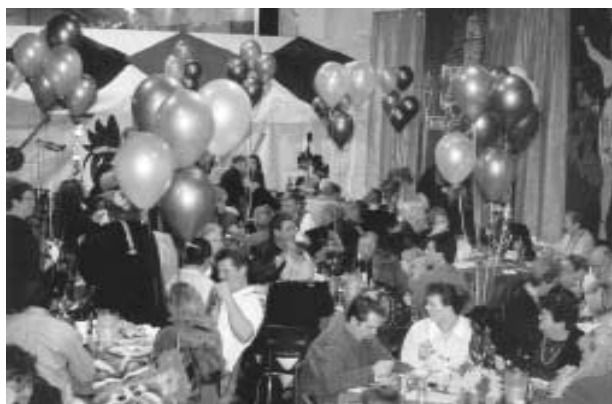
Diners enjoy the meal and await the Wine Auction.