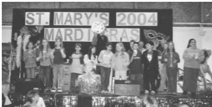
Live auction sales pitch by fourth grade.