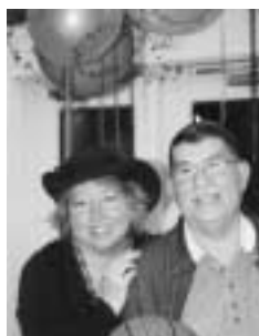
Balloon time on Bourbon St.